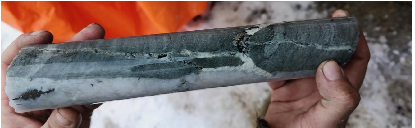
Photo 7 & 8: Quartz vein (25 cm) containing fuchsite and semi-massive pyrite in hole WD24-35 and closeup of semi massive sulphide mineralization in hole WD24-39.